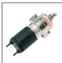
Advanced infrared point gas detector