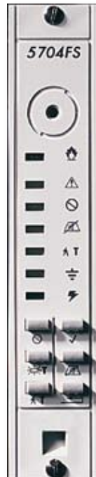
Fire Status Panel