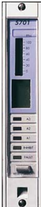
Single Channel Gas Control Card