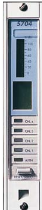
Four Channel Gas Control Card