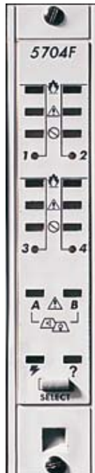
Four Zone Fire Card